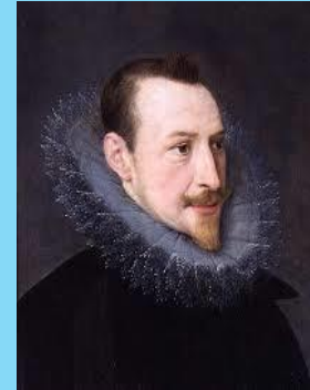
Edmund Spencer 1552- 1599