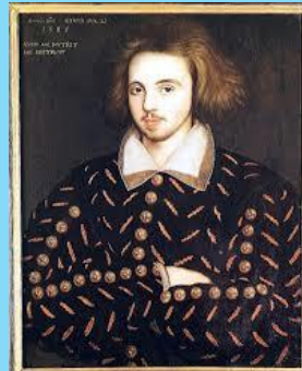
Christopher Marlowe 1564-1593