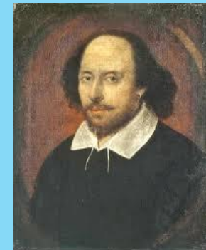
William Shakespeare 1564-1616