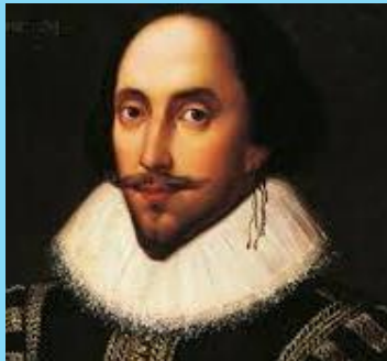
Thomas Kyd 1558-1594