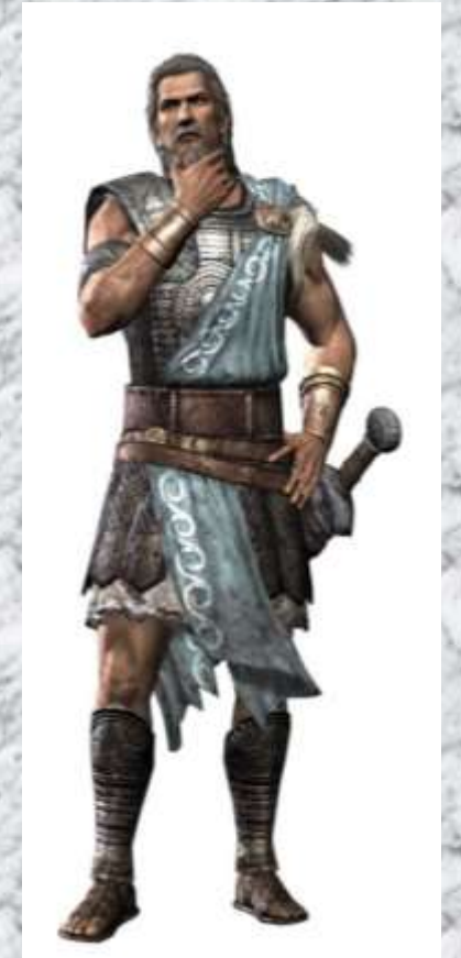
He asks Odysseus for help . . .