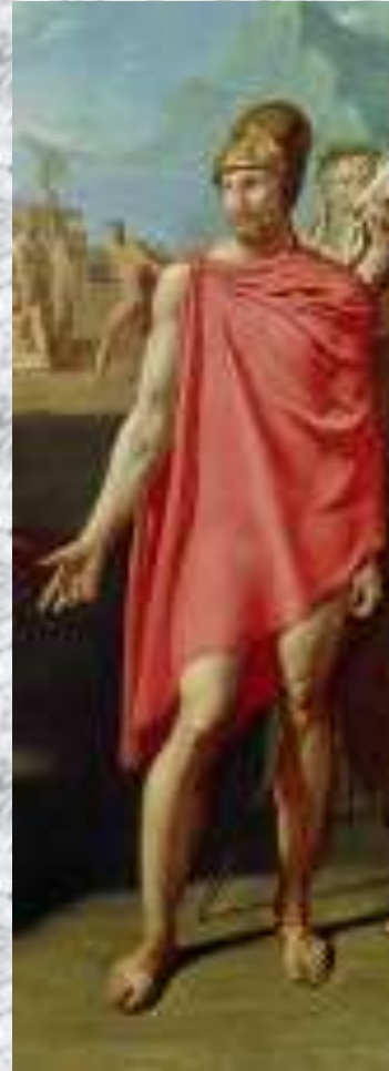
He asks Agamemnon for help . . .