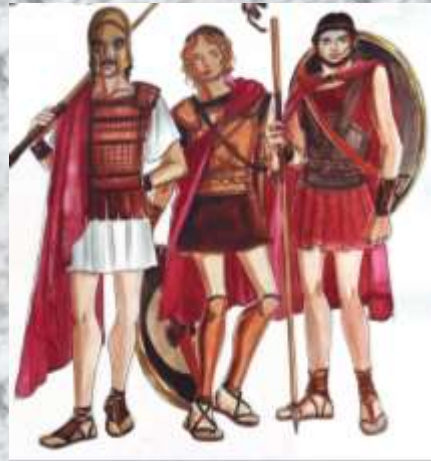
He gathers his army . . .